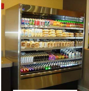
Shown with solid ends CES model