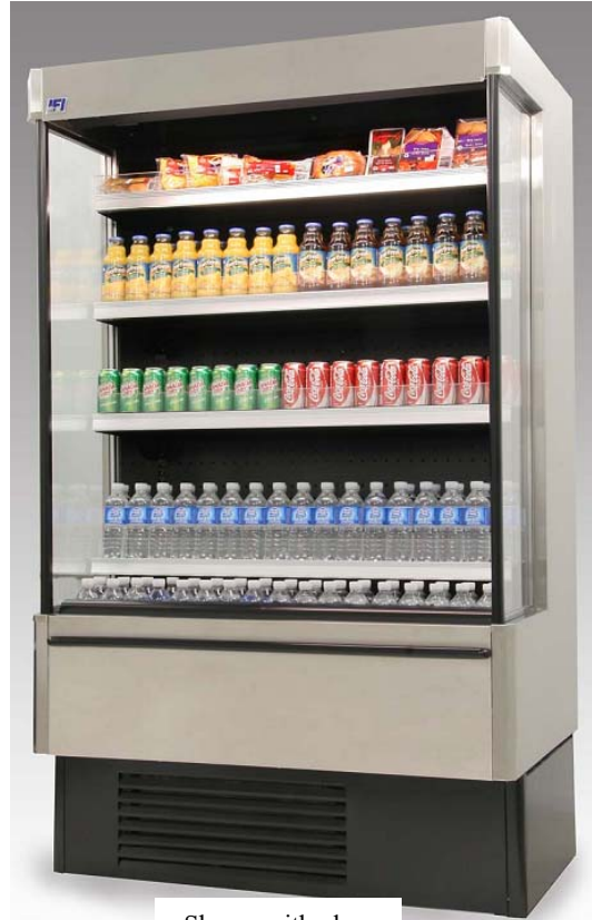
Shown with glass ends CEG model