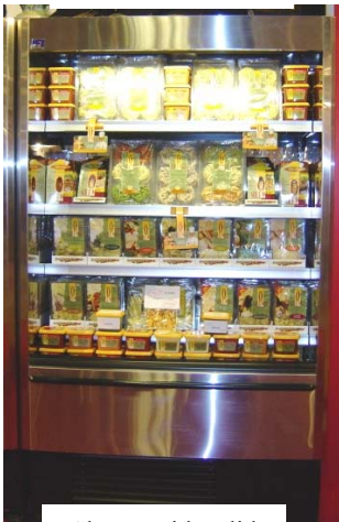
Shown with solid ends CES model